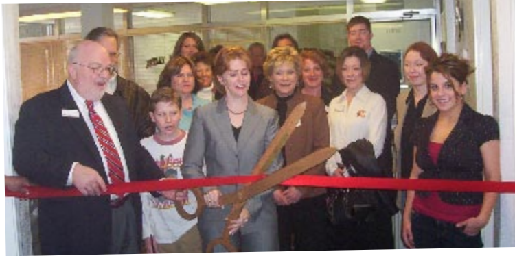
Nevada Court Services 03/13/08