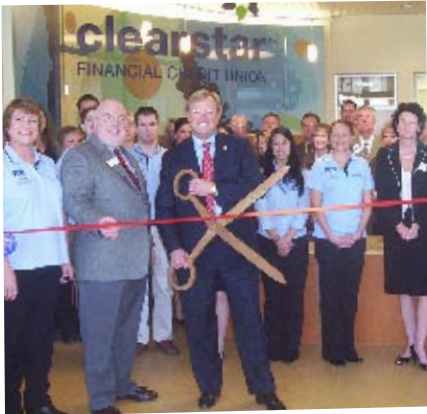
Clearstar Financial Credit Union 1/18/08