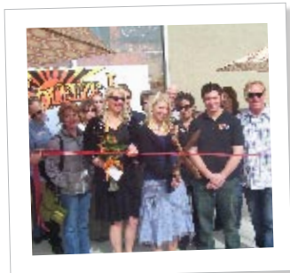
Squeeze In 03/07/08