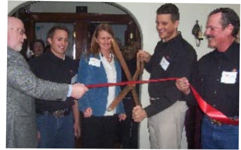
Sun-E Concepts 02/22/08