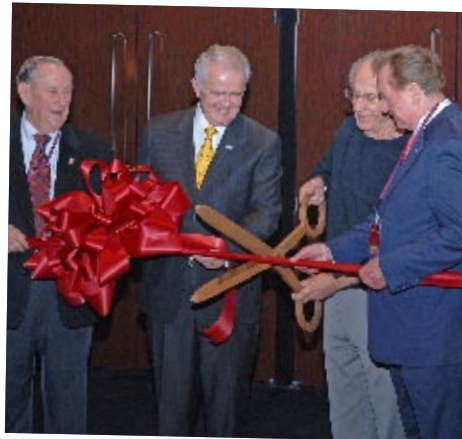
Peppermill Grand Opening 12/20/07