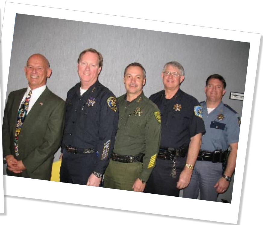
President, LR2 Consulting Group; Chair, Business Leadership Council, Reno Sparks Chamber of Commerce