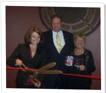
Aevos Office Suites 10/30/07