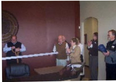
The JWB Management Group, LLC. 03/14/08